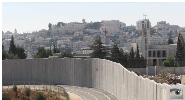
The wall surrounding Bethlehem

O little town of Bethlehem, how still we see thee lie! Above thy deep and dreamless sleep the silent stars go by. Yet in thy dark streets shineth the everlasting light; today. the hopes and fears of all the years are met in thee tonight.